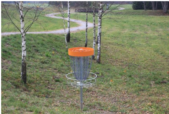
Picture 1. Diskgolf site in Rietavas park.

If no, provide reasons of why / which hindrances: